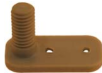
← ALAN's Motor Bracket