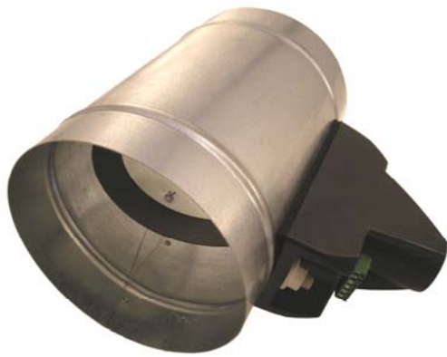
← Fully Assembled