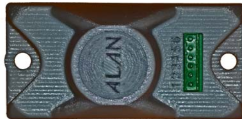
← ALAN's Motor