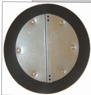
ALAN's Disk/ Blade or your Blade